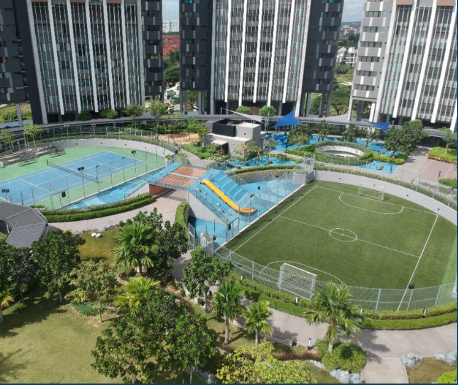
Located in the Wealthy Enclave of Tropicana